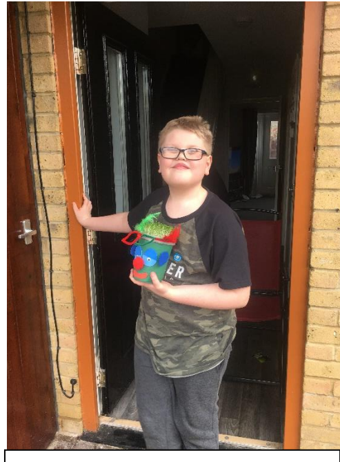
BS2 has been growing his own Cress at home during the lockdown.