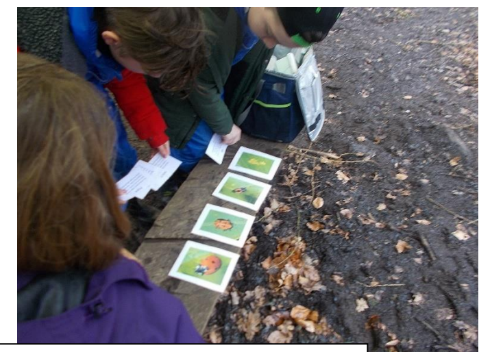
Puffins Class enjoying their walk to see the pigs and also looking for creepy crawlies.