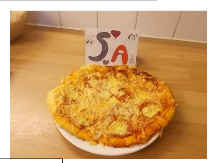
Pizza being made in the cooking lessons