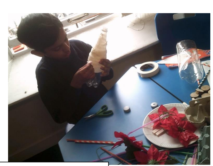
Koalas completing their Art lesson using recycled items