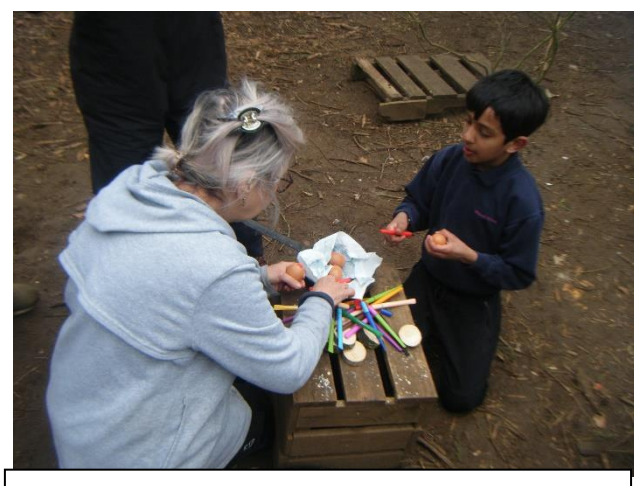
Decorating eggs ready to roll them down the hill