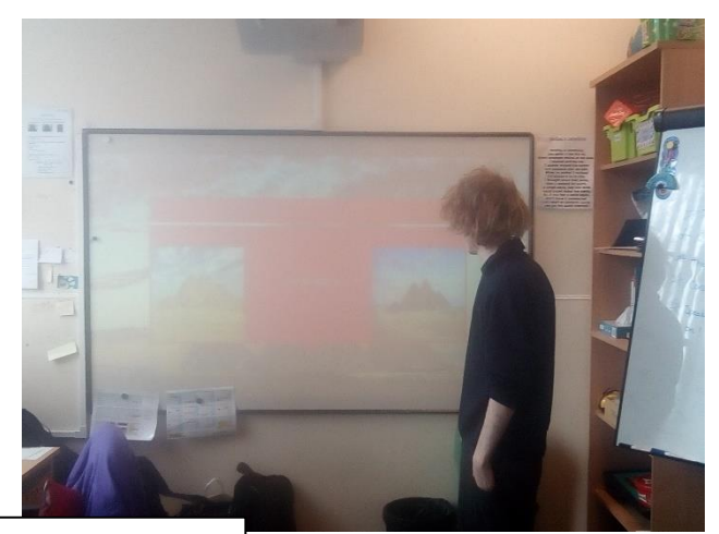
Smarties class showing off their Power Points