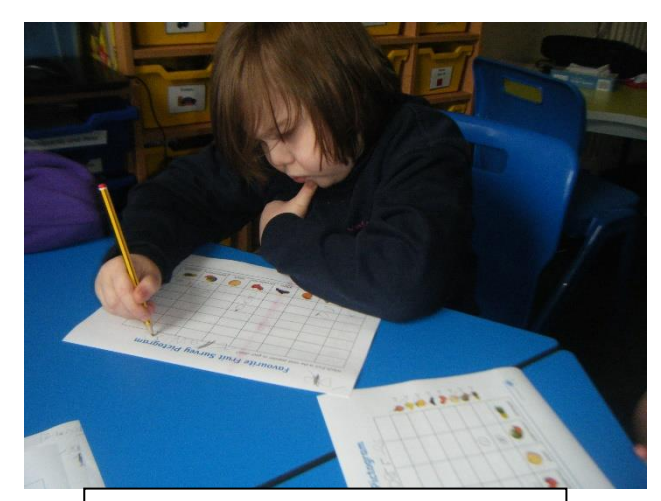
Maths lesson taking place in Koalas