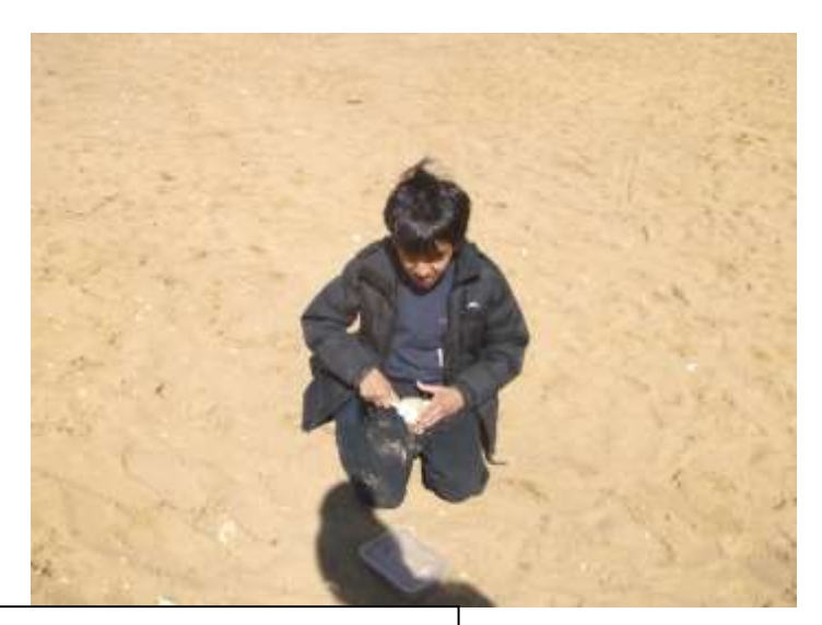
Koalas identifying the different types of rock at Old Hunstanton