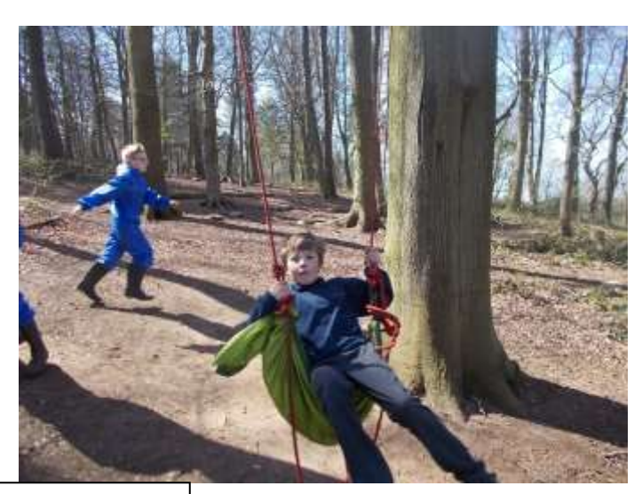
Puffins Class at Forest school