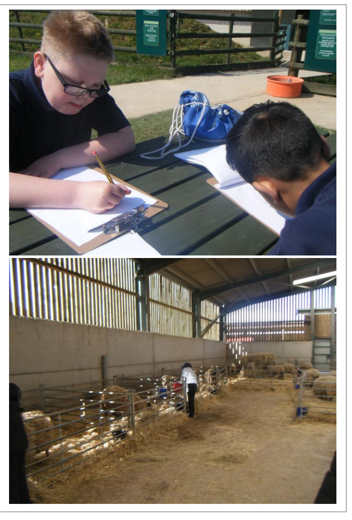
Everyone has a personal best