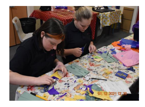
Individual Stained - Glass Windows - Anglia - Way