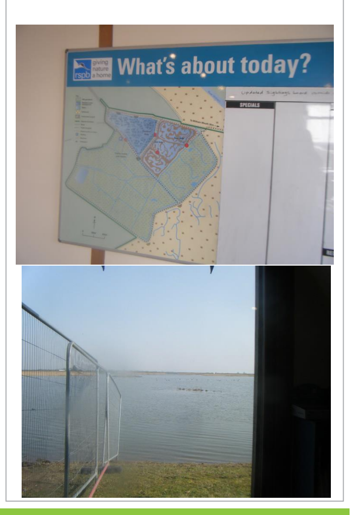
Everyone has a personal best