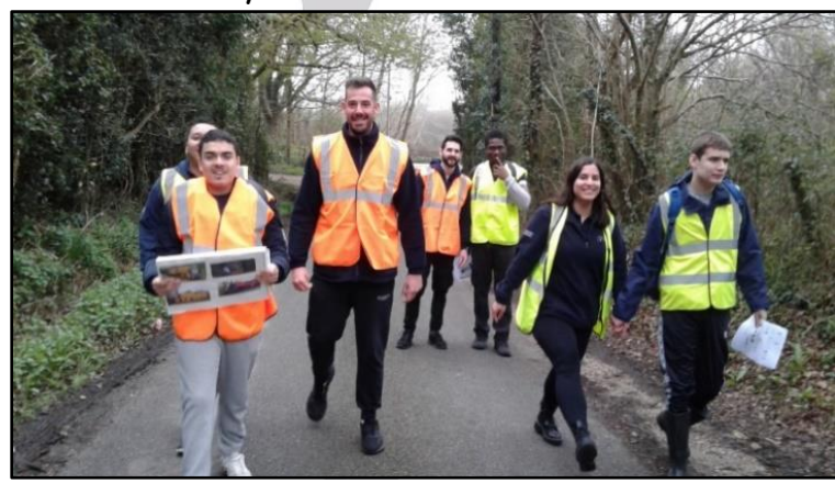
#MAKEONECHANGE What one change can you make today?

For our first Recycling Day, everyone was encouraged to collect cardboard, clothing, metal cans, plastic, as well as flower and vegetable seeds for a day of fun activities.