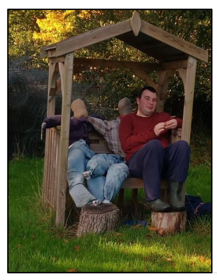
The My Healthy Advantage mobile app

The health and wellbeing mobile app provides an enhanced set of wellbeing tools and engaging features. The features are designed to improve the user's mental and physical health by using personal metrics to set goals and achievement.