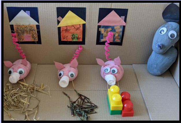
Second Prize goes to Invincible. We loved the use of a variety of materials in this creation, especially the marshmallow noses!