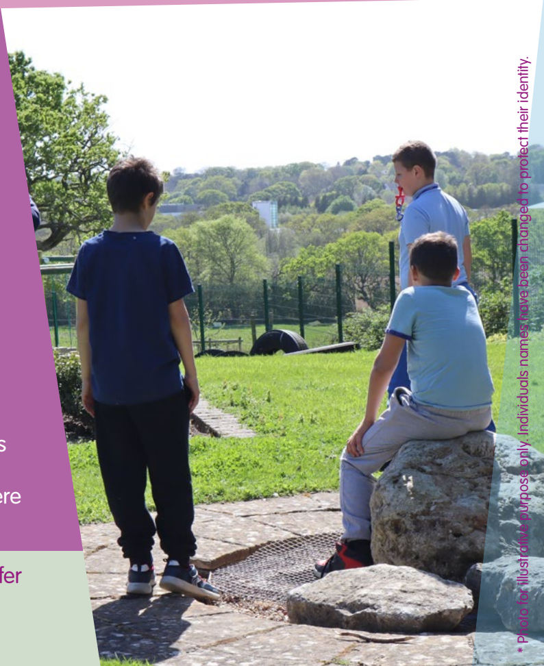
* Photo for illustrative purpose only. Individuals names have been changed to protect their identity.

Cameron's family just wanted him to be happy, that was their sole desire from the placement at Southlands. They have worked with and have supported the team at Southlands to make decisions enabling Cameron to have consistency both at home and at school. To see Cameron achieve fantastic academic results and to become independent is more than they ever thought was achievable. They now see that Cameron has a real future and they are very much looking forward to where the future takes him as are the team at Southlands.