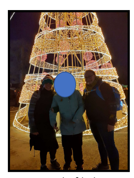
Festival of lights