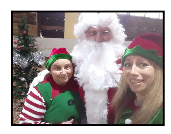
Santa visits TFS!