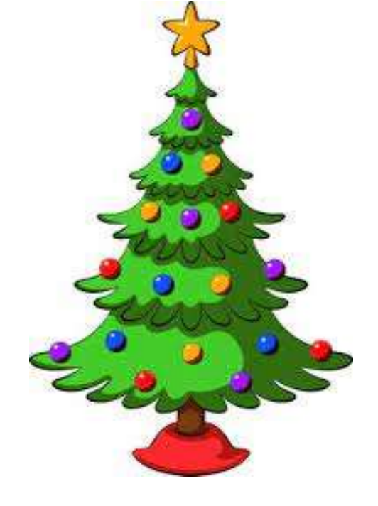
December 2023 Newsletter