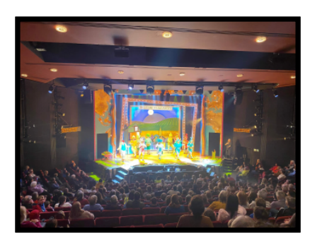
TFS visited the pantomime!

JH has been accessing the bus regularly!