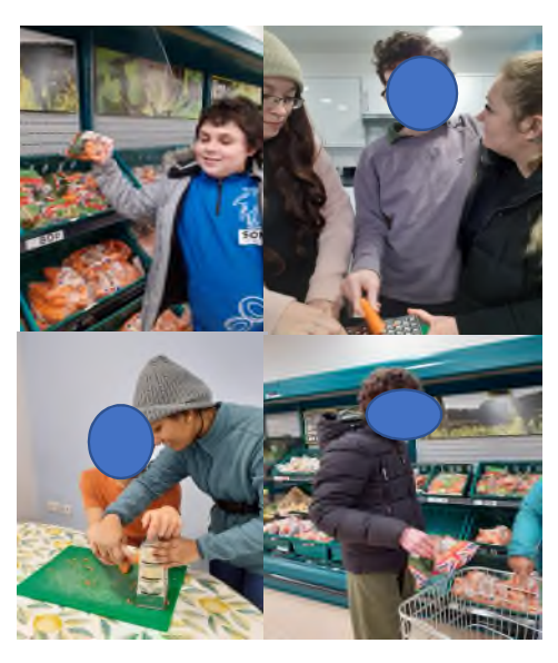
Laurels have been looking at carrots for vegetable of the week!