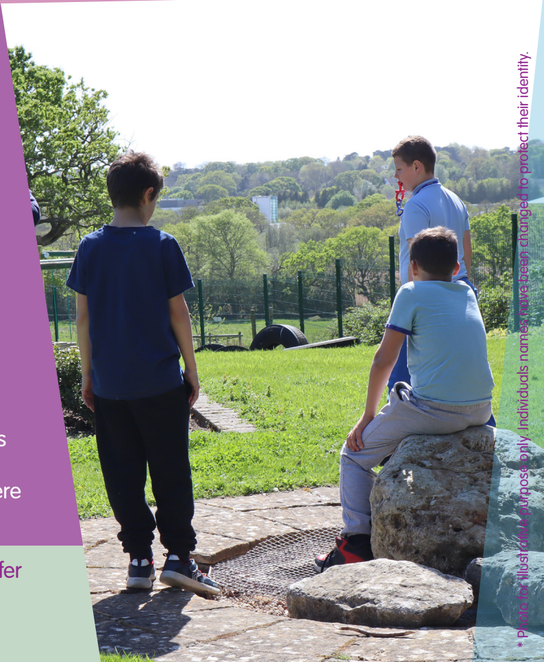
* Photos for illustrative purposes only. Individuals names have been changed to protect their identity.

Cameron's family just wanted him to be happy, that was their sole desire from the placement at Southlands. They have worked with and have supported the team at Southlands to make decisions enabling Cameron to have consistency both at home and at school. To see Cameron achieve fantastic academic results and to become independent is more than they ever thought was achievable. They now see that Cameron has a real future and they are very much looking forward to where the future takes him as are the team at Southlands.