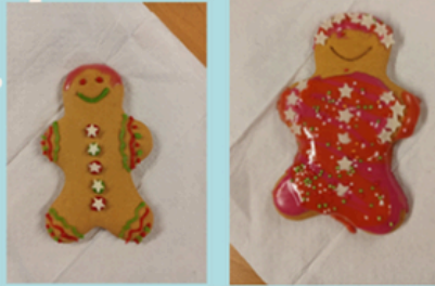
Sixth Form Gingerbread Decorating