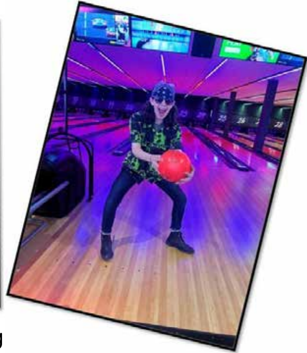
'Deranged' DT Winning at Bowling